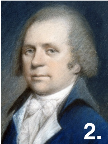
Charles Cotesworth Pinckney